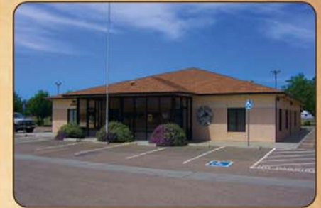
Red Bluff Round-Up Museum

This museum houses an extensive collection of photographs and memorabilia relating to the Red Bluff Round-Up since its beginning in 1921.