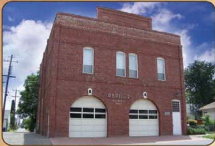
Red Bluff Fire Station No. 2 Museum

Located in a restored brick fire station dating from the days of horse drawn equipment, its focus is the preservation and display of early firefighting equipment, tools and photographs. Displays include the Red Bluff Fire Department's first motorized pump.