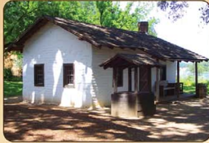
Old Adobe House at William B. Ide Adobe State Historical Park

The park includes an information center, picnic areas and an old adobe house thought to have been used by William B. Ide, California's only president of the Bear Flag Republic in 1846. The park also has many items used in everyday life during the 1850's. Interpretive programs offering hands-on activities are offered periodically throughout the year.