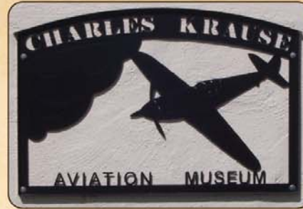
Charles Krause Aviation Museum

This museum aims to provide information about the aviation history of Tehama County. Displays include photographs of classic airplanes, information about the Red Bluff Naval Air Station, distinguished local pilots and the first U.S. Navy aircraft carrier and it's connection to Red Bluff.